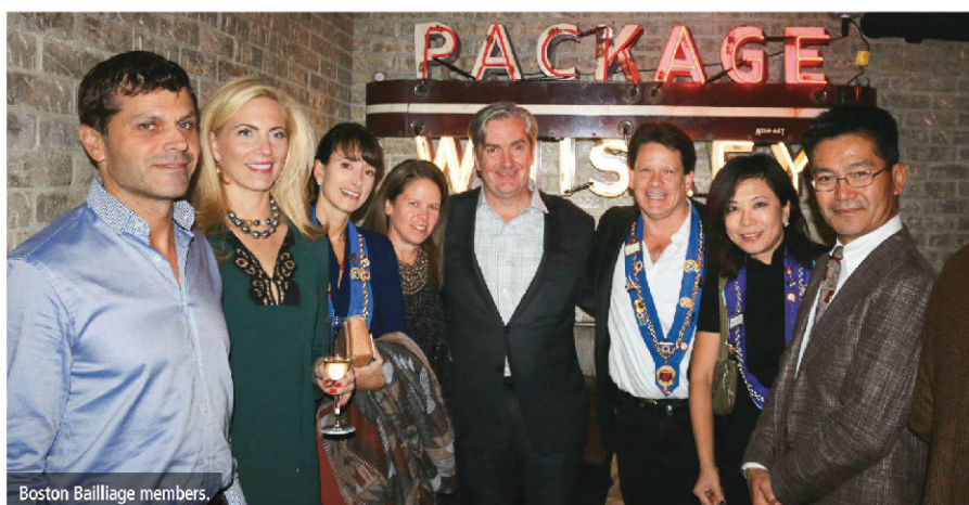
Boston Bailliage members.

For their part, Boston confrères enjoyed a multitude of courses that pleased carnivore and vegetarian alike, and once the seemingly never-ending cavalcade of delicious dishes was complete, they trundled off to Harvard Square completely sated. G